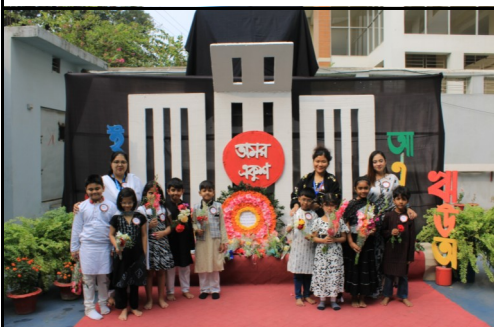
Students paying their respects to our martyrs at the Ekushey Memorial at Lower.